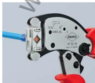
Uniquely flexible: connectors can be inserted in the rotatable crimp head from almost any position