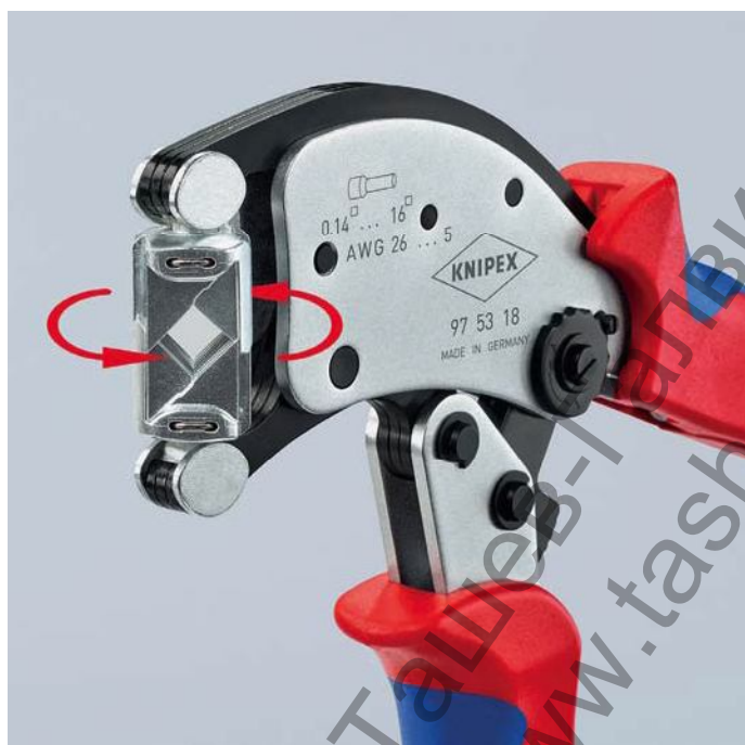
Crimp head can be rotated 360° for optimal accessibility, even in confined spaces