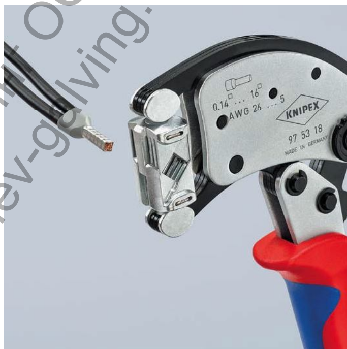
Twin end sleeves (ferrules) up to 2 x 6 mm 2 can be crimped without adjustment